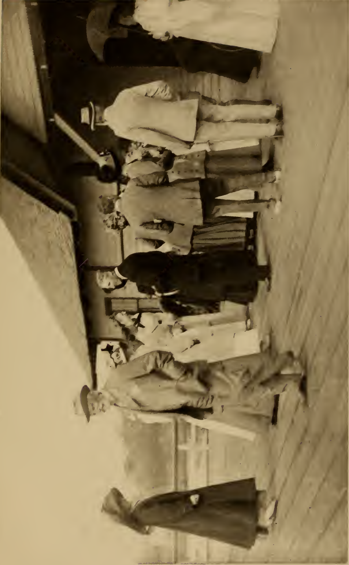
"GOOD BYE" ON JEKYL WHARF